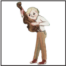
de Schriefdisch the desk