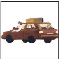
de Rullstauhl the wheelchair