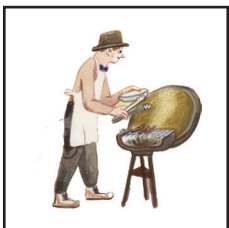
de Grotvadder the grandfather